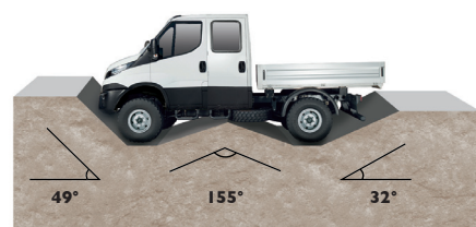
Approach angle Ramp angle Departure angle